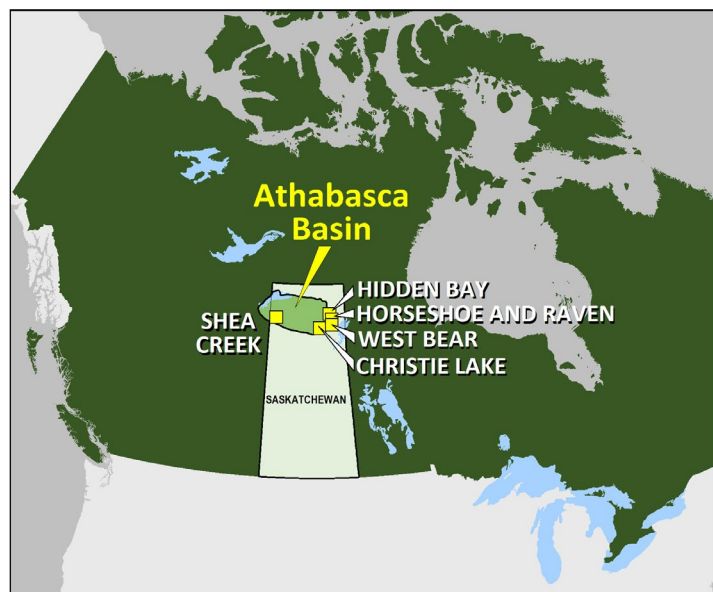
Figure 1 – Athabasca Basin

Athabasca Basin uranium deposits are classified as unconformity-type deposits. They are developed at, and below, the unconformity at the base of the shallow-dipping, Proterozoic Athabasca sandstone, either at its contact with the underlying metamorphosed gneiss sequence, or within the gneiss up to a distance of 800 metres (m) below the unconformity. Both of these styles of mineralization are frequently associated with graphitic gneiss units in basement rocks and faults associated with these lithologies, which together form conductive, geophysical anomalies that can be traced using electromagnetic surveys.